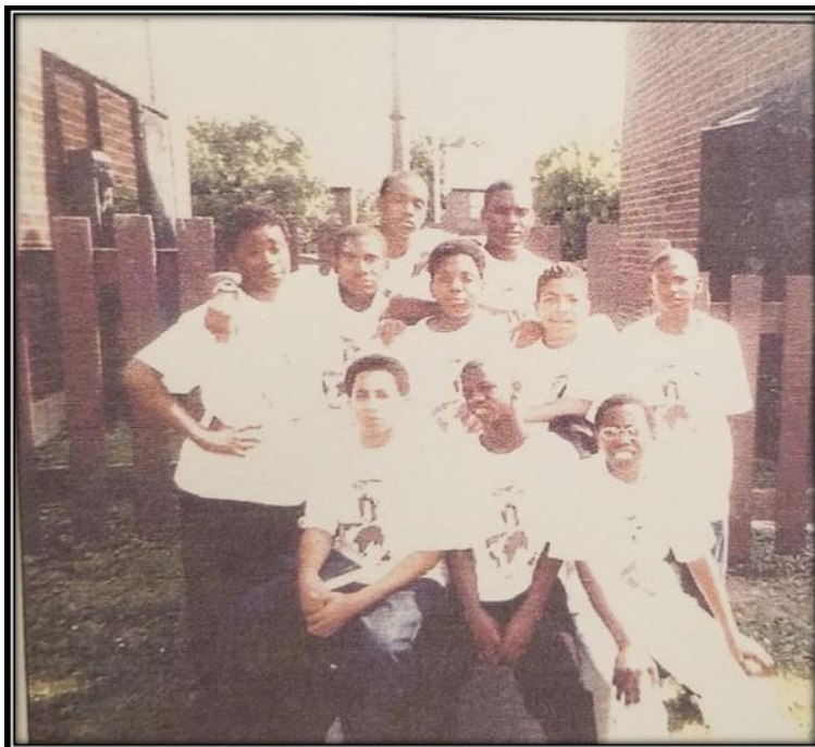
Junior Laymen at the "Street Canvassing Site" during the 2002 97 th National Baptist Congress of Christian Education, St. Louis Missouri